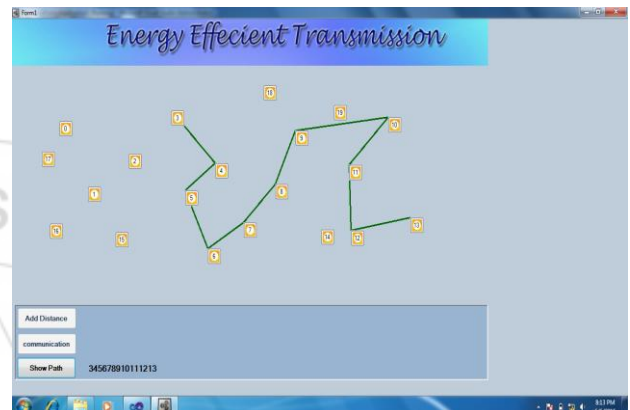
Figure 1: Snapshot for finding shortest Path

i) LEACH (Low energy adaptive clustering hierarchy ) protocol) : To route the path it is assumed that the WSN consists of stationary sensor nodes randomly deployed in an L \times L field and a single mobile anchor node. It is assumed that the mobile anchor node obtains its position coordinates via a x, y co-ordinate. If three beacon points are obtained on the communication circle of a sensor node, it follows that the mobile anchor node must pass through the circle on at least two occasions. LEACH (Low energy adaptive clustering hierarchy) the networks are divided in to the number cluster and the each cluster are divided in to the two parts that is cluster head and non-cluster head. We calculating cluster head by, a node carry much energy is set as a cluster head.