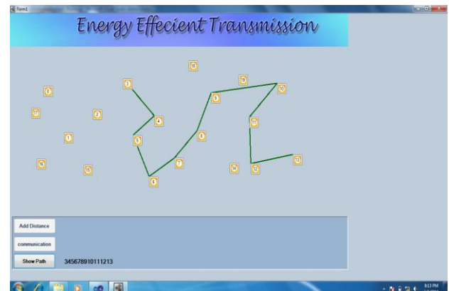
Figure 1: Snapshot for finding shortest Path

i) LEACH (Low energy adaptive clustering hierarchy ) protocol) : To route the path it is assumed that the WSN consists of stationary sensor nodes randomly deployed in an L \times L field and a single mobile anchor node. It is assumed that the mobile anchor node obtains its position coordinates via a x, y co-ordinate. If three beacon points are obtained on the communication circle of a sensor node, it follows that the mobile anchor node must pass through the circle on at least two occasions. LEACH (Low energy adaptive clustering hierarchy) the networks are divided in to the number cluster and the each cluster are divided in to the two parts that is cluster head and non-cluster head. We calculating cluster head by, a node carry much energy is set as a cluster head.