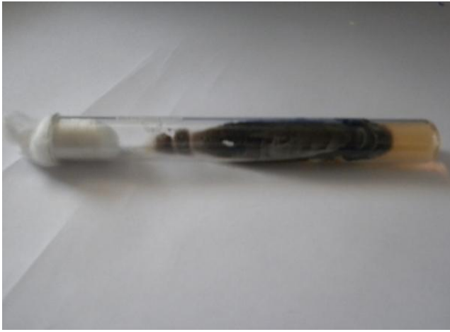
Growth on SDA