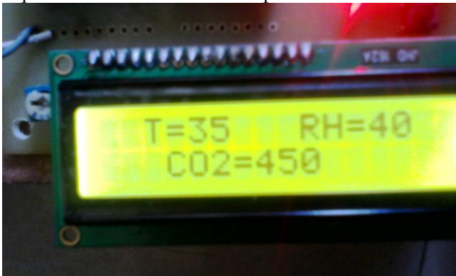
Figure 3: Average Values Calculated

After completion at appoint it will move on next point and take further reading for next location stop point. When it finish taking all reading from start to stop point microcontroller performance calculation of average its reading of Humidity, Temperature, and CO 2 . And display it on LCD for user interface. According to difference between calculated and required amount of environmental parameter.