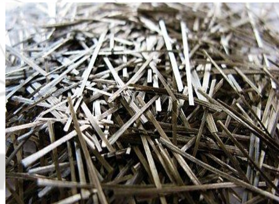
Figure 1.1: Basalt fiber

Basalt has a fine-grained mineral texture due to the molten rock cooling too quickly for large mineral crystals to grow, although it is often porphyritic, containing the larger crystals formed prior to the extrusion that brought the lava to the surface, embedded in a finer-grained matrix.