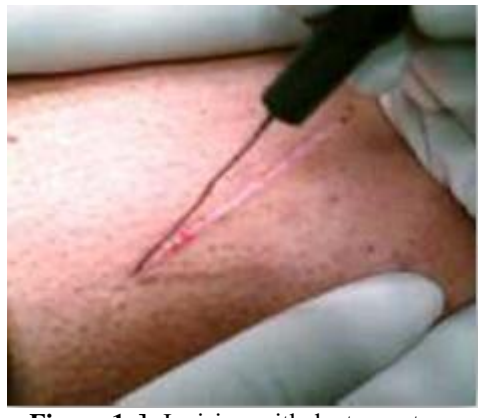
Figure 1a]: Incision withelectrocautery

Closure of the subcutaneous tissue is done with 2-0 polyglactin simple interrupted suture and skin closure is done with 3-0 nylon, either simple interrupted or mattress suture.