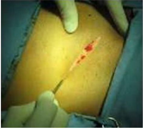
Figure 1b]: Incision with scalpel