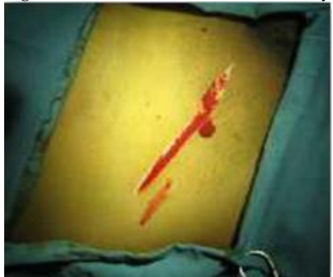
Figure 5b]: Incision site after scalpel