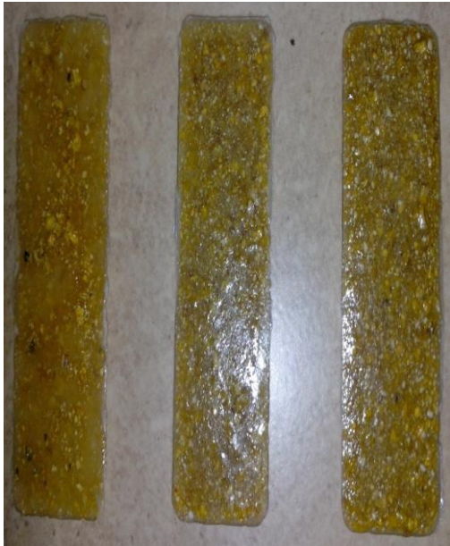
Figure 1: Composites with three different compositions