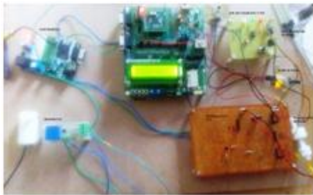
Figure 3: Transmitter Section

The results during observing, for testing the accuracy of the core system, we send an instruction as input to the ARM processor, through GSM using mobile, the result which is processed by the processor will be sent to the mobile and displayed on the LCD screen for different inputs from the sender.