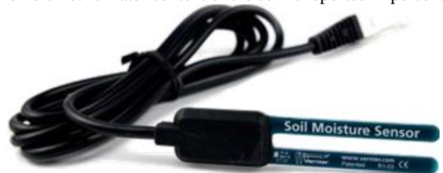
Figure 2: Soil Moisture Sensor

Measuring soil moisture is very important in agriculture to help farmer for managing the irrigation system. Soil moisture sensor is one who solves this. This sensor measures the content of water. Soil moisture sensor uses the capacitance to measure the water content of soil. It is easy to use this sensor. Simply insert this rugged sensor into the soil to be tested, and the volumetric water content of the soil is reported in percent.