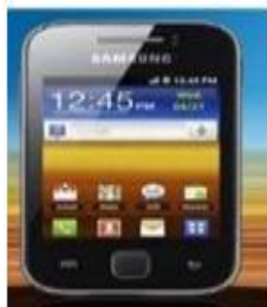
Figure 4: Receiver Section

The results during observing, for testing the accuracy of the core system, we send an instruction as input to the ARM processor, through GSM using mobile, the result which is processed by the processor will be sent to the mobile and displayed on the LCD screen for different inputs from the sender.