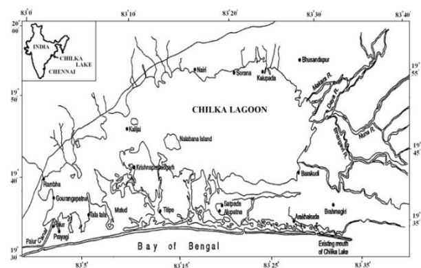
Figure 1: General location map of Chilka Lake

brings silt into the lake, control the northern end of the lake. A 60 km long barrier beach called Rejhansa (Singh et al. 2005) formed by northerly currents in the Bay of Bengal, resulted in the formation of this shallow lake and forms its eastern side. Hydrology: the hydrological subsystems control the hydrology of the lake. The land based system comprises distributaries of the Mahanadi River on the northern side, 52 river channels from the western side and the bay of Bengal on the eastern side. Two of the three southern branches of the Mahanadi river that trifurcates at Cuttack, feed the lake. All the inland river systems discharge an annual flow of about 0.375 million cubic meters of fresh water which is estimated to carry 13 million metric tons of silt into the lake. On the northeast a channel connects the lake to the Bay of Bengal. Water quality: the lake water is alkaline P H ranging from 7.1 to 9.6. The southern sector of the lake has highest alkalinity. Salinity levels in the lake show wide temporal and spatial variation due to complex blend fresh water discharge, evaporation and tidal inflow of seawater.