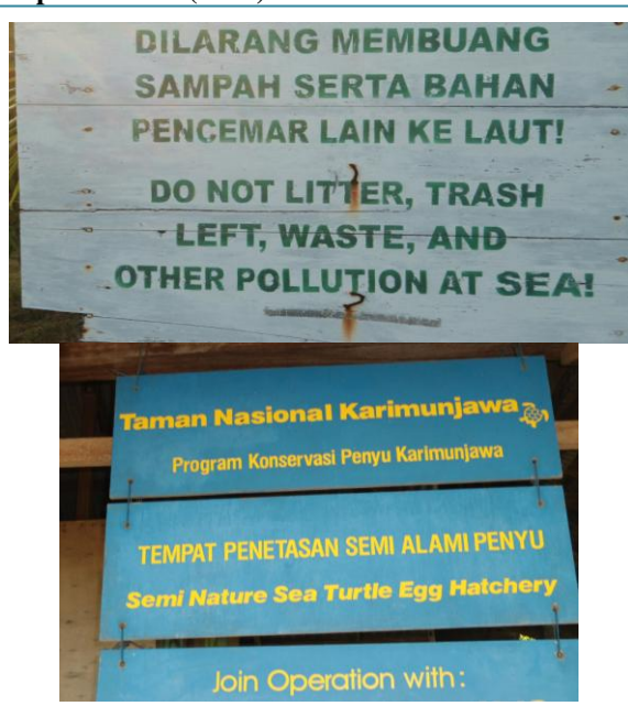
Figure 3: Board information regarding the conservation softskill

In Figure 3, further classified on category types of soft skills listed in tersebu information boards. Soft skills conservation classification results are presented in Table 1.