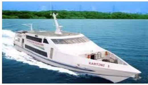
Figure 2: Ship Kartini to transport Semarang to Karimunjawa

In the study, the research team towards the island of Karimun using ship transport ship Kartini of Semarang toward karimunjawa or otherwise with a long trip around 5 hours or may use air travel from Semarang to Karimunjawa and takes about 40 minutes