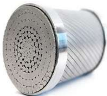
Figure 2: Cross section view of FLC