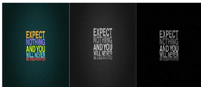
Figure 2: Image preprocessing results

In this subpart we firstly read image from which text has to be extracted. Then Convert the colored image to gray image to avoid processing overload, after the conversion into gray scale we remove background of image to decrease complexity of image [6]. At last we remove the noise from image by using morphological filtering.