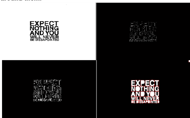
Figure 3: Results of text localization and extraction.

In this subpart first of all Conversion of gray image into binary image by defining the threshold of the image is done. After that edges of the components are detected, these components may have text part or non text part, which later on determined on basis of a three way step. After the edge detection morphological operations are applied to the image. Firstly dilation and then erosion of image is done. We choose the structuring element in accordance to the cluster of image text[1]. Generally we preferred rectangular structuring element of dimensions (2*3). After that connected components are extracted and bounding boxes are placed around them.