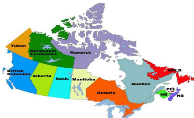
Figure 5: Cluster 1 type image

JUDAS PRIEST 775758 HOLA DIEGO 1 2 3 1 2 3 6 7 9 4 5