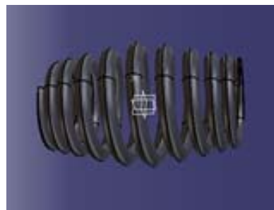
Figure 1: The three-dimensional map of variable stiffness coil spring

Variable stiffness coil spring consist of two or more different pitch spring[4]. The three-dimensional map of variable stiffness coil spring is shown Fig.1.