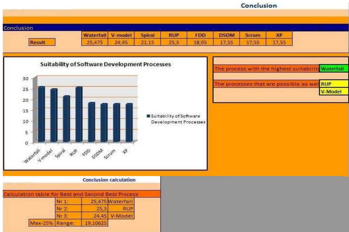
Figure 1-4: Screenshot of Framework – Conclusion