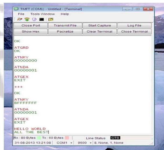
Figure 4: TMFT Program

This simulation output is represents Tarang module configuring using AT commands with in terminal of TMFT program.