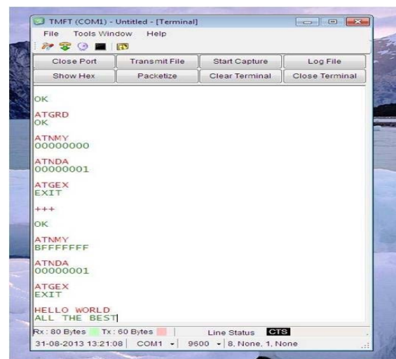
Figure 4: TMFT Program

This simulation output is represents Tarang module configuring using AT commands with in terminal of TMFT program.