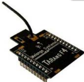
Figure 2: Tarang Module

ARM cortex architecture optimized for embedded applications. An analog-to-digital converter is a peripheral converts a continuous analog voltage to a discrete digital number. The stellaris ADC module features 12-bit conversion and resolution and support 12 input channels. Each ADC module provides eight digital comparators. The trigger source for ADC0 and ADC1 may be independent or the two ADC modules may operate from the same trigger source and operate on same or different inputs. The features are on-chip internal temperature sensors, 12-bit precision ADC, maximum sample rate of one million samples/second, Flexible trigger control, Hardware averaging of upto 64 samples.