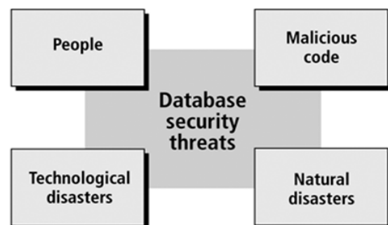
Figure 1: Threats of database security

The objective of database security is to protect database from accident or intentional los. These threats pose a risk on the integrity of the data and its reliability. Database security allows or refuses users from performing actions on the database.