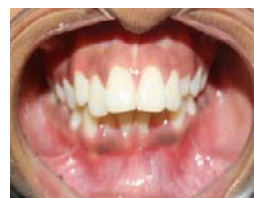
Figure 1.1: Dental photograph

Dental photograph is a pictorial view of teeth structure and its appearance; it gives relative position of neighboring teeth and shapes of dental work. It can be taken by any digital camera by stretching upper and lower lips as shown in fig