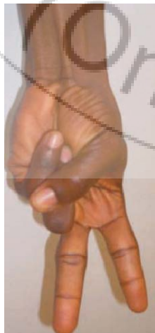
Figure 4: Pushpakumakar's (2004) two finger sign method.

Pushpakumakar's test: It involves extension of the index and middle finger with flexion of the other fingers and the wrist followed by opposition and flexion of the thumb (see figure 4).