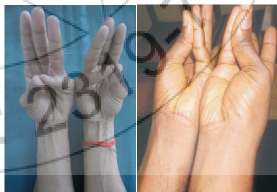
Figure 1: Schaeffer's test, in the left figure The individual have both the palmaris longus muscles and in the right figure the individual has none.

Schaeffer's Test: Schaeffer's test is used in order to visualize or palpate the palmaris longus tendon. Participants are asked to oppose their thumb and little finger with slight flexion of the wrist. If the palmaris longus tendon is present, it would be visible at the distal aspect of the forearm (see figure 1).