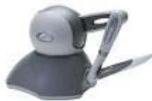
Figure 2: Phantom Device

The above figure 2 shows Phantom device. PHANTOM haptic interface is one of the widely used haptic devices. This device measures a user’s finger tip position and exerts a precisely controlled force vector on the finger tip. The device has enabled users to interact with and feel a wide variety of virtual objects and will be used for control of remote manipulators [3].