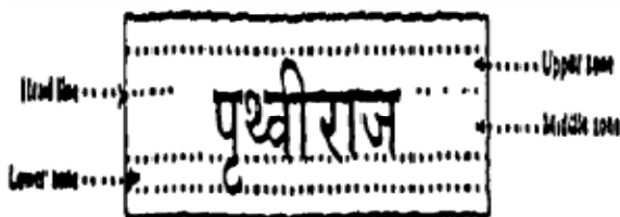
Figure 9: Segmentation of Images

Histogram based technique is one technique used for segmentation of lines and words [1]. Once words are segmented from lines, head line is located and removed. After that word is divided into three horizontal parts known as upper zone, middle zone and lower zone. Individual characters are separated from each zone by applying vertical scanning.