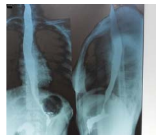
Figure 5 : Barium swallow is normal