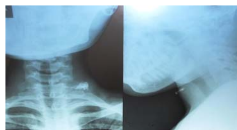
Figure 4: x- ray soft tissue neck showing abscess

3.4: Flexible Laryngoscopy revealed no abnormality.