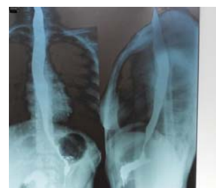
Figure 5 : Barium swallow is normal