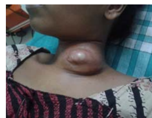
Figure 3: Branchial cyst with abscess at the time of presentation

It reveals a soft, fluctuant, tender, ovoid swelling approximately 7cmx 5cm in its greatest dimensions. Extending from anterior border of (L) sternocleidomastoid muscle to about 1 cm lateral to midline. Vertically it extended from the level of hyoid to the junction of middle & lower 1/3 of anterior border of (L) sternocleidomastoid muscle.