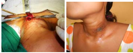
Figure 6: (A) Intra-operative pic during excision of cyst (B) Post-operative

3.10 The biopsy report was suggestive of tuberculosis. The patient was put on ATT of DOTS strategy. Till the date patient has no recurrence and is doing well.