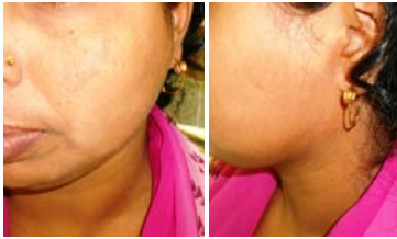
Figure 1: (L) parotid gland swelling at the time of presentation.