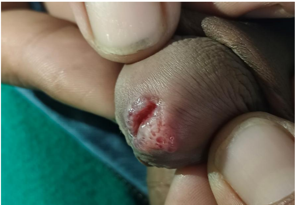
Image 2: Another image showing lesion of LC at the external urethral meatus in the patient.