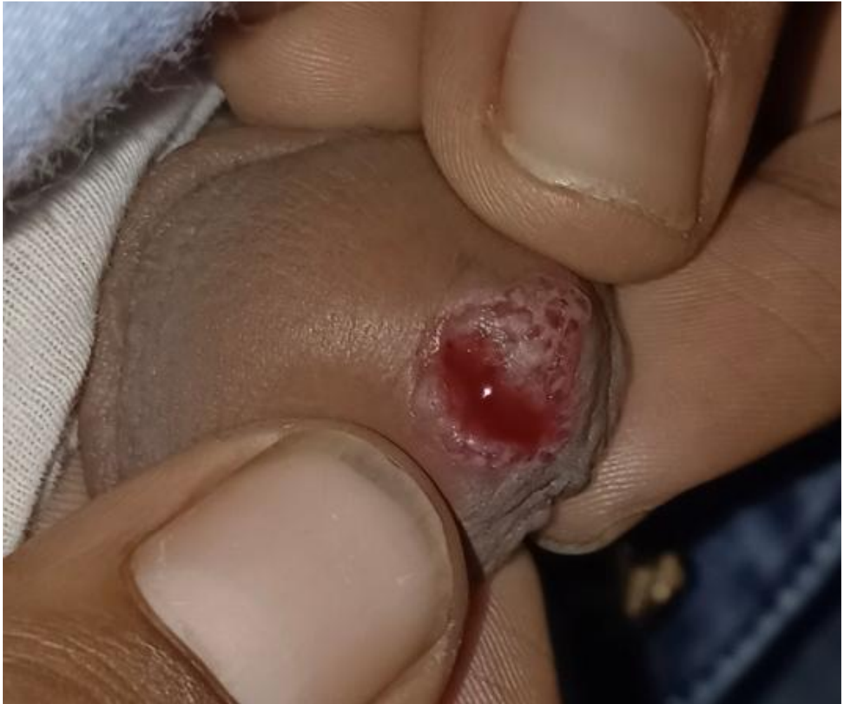
Image 1: Lesion of lymphangioma circumscriptum(LC) seen over the external urethral meatus