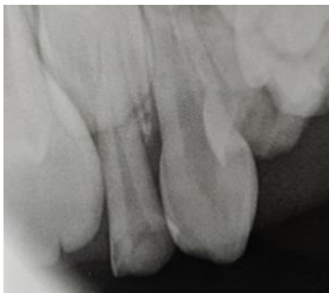
Figure 2: Intraoral periapical radiograph of tooth 54 revealing extensive coronal destruction, widened periodontal ligament space, and furcation involvement, confirming chronic pulpal pathology and necessitating extraction