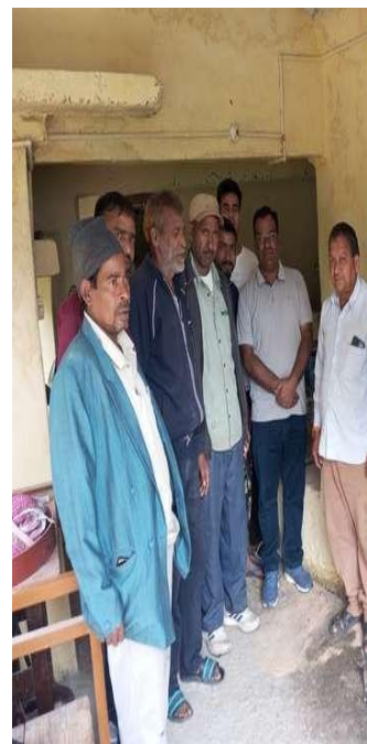
Distribution of planting materials to the farmers and training programme organized by implementing agency among the farmers