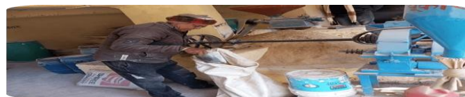
Figure 2: Establishment of spices grinding machines at common facility center among farmers.