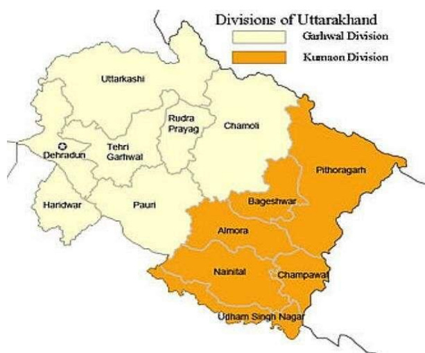
Map of Study Area (Uttarkashi District)

Description of study area: The study site was located in 5 villages of Uttarkashi District of Uttarakhand State. Uttarkashi District is a District of Garhwal division of the Uttarakhand state in Northern India and has its headquarters at Uttarkashi city. Uttarkashi is located at 30.73°N 78.45°E. It has an average elevation of 1,165 meters (4,436 feet) & Most of the topography is hilly. The Uttarkashi District of Uttarakhand State has a mountainous terrain with snow-covered peaks, deep valleys, forests and rivers. The climate varies from cool summers to very cold winters, especially in higher regions. Agriculture, animal husbandry, tourism and pilgrimage-related activities are the main sources of livelihood for the people. Uttarkashi is also known for adventure tourism, including trekking, mountaineering, and river rafting and camping. The people mainly speak Garhwali and Hindi and the local culture includes traditional music, festivals and simple mountain lifestyles. Overall, Uttarkashi district is a place of spiritual significance, natural beauty and cultural heritage.