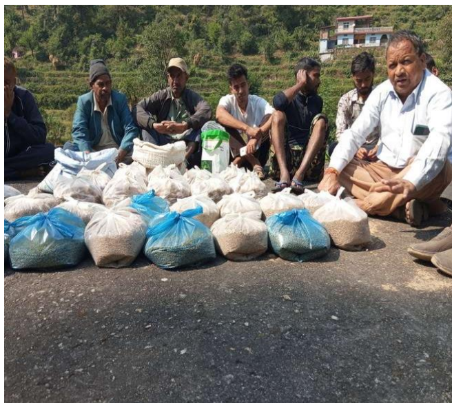
Distribution of planting materials/Germplasm/Seeds to the project beneficiaries for the spices cultivation.