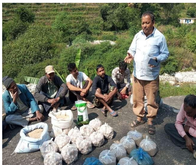
Distribution of planting materials to the farmers and training programme organized by implementing agency among the farmers

A. Edaphic condition: Certain physical & chemical properties of soil of the study plots were analyzed for the present investigation (Table.1.1).