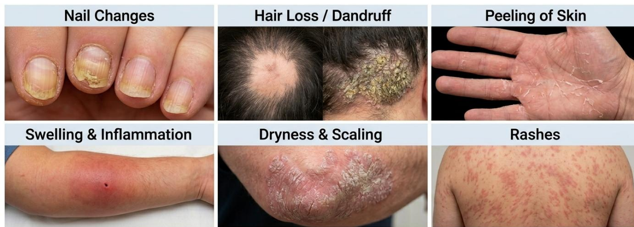
Figure 1: Dermatological conditions: A clinical overview for research