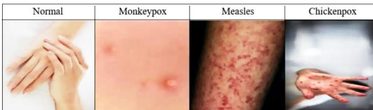
Figure 2: Dermatological conditions: A clinical overview for research