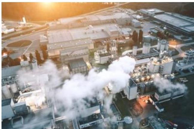
Figure 1: Industrial Waste Heat

This review paper aims to analyze recent developments in thermoelectric generator technology for waste heat recovery applications. It highlights the working principles, advantages, limitations, and potential applications of TEG systems. The paper also discusses current challenges and future research directions to enhance the performance and commercial viability of thermoelectric generators.