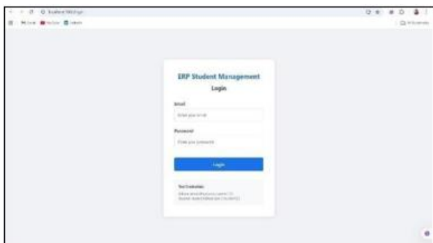
Figure 1: Login Portal