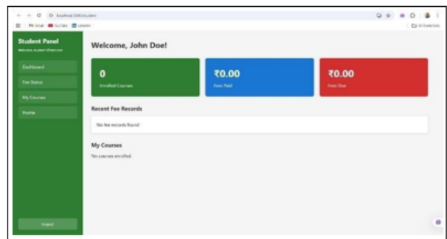
Figure 3: Student Dashboard