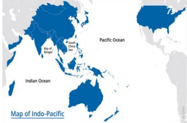
Figure 1: Map showing countries that fall in Indo-Pacific region

The Indo-Pacific is identified as an integrated region that combines the Indian and the Pacific Ocean and other land masses surrounding them. It stretches from the Eastern Coast of Africa to the islands of the South Pacific and includes four continents Asia, Africa, Australia, and America. The region is notable from both strategic and economic perspectives. The area is economically active contributing 2/3<sup>rd</sup> of the global economic output, 46% of the world's merchandise trade, and 62% of the world GDP. It is home to important maritime trade routes (e.g. Strait of Malacca, Suez Canal, Lombok Strait, Bab el Mandeb Strait, Ombai Strait) facilitating trade between Asia, Europe, and Africa. The region has a profile of rich forests, marine resources e.g. offshore hydrocarbons, Methane hydrates, sea bed minerals, fisheries, etc., and natural resources like energy, water, oil, minerals, etc. Because of its strategic importance, the region has become an arena of conflict and competition between great powers such as the United States of America, China, Australia, India, Japan, etc.