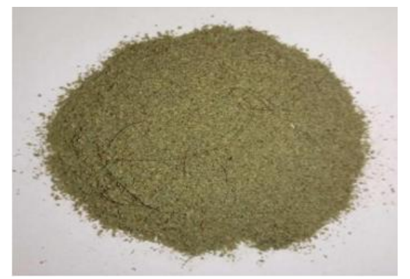
Figure 10: Powdered Azolla