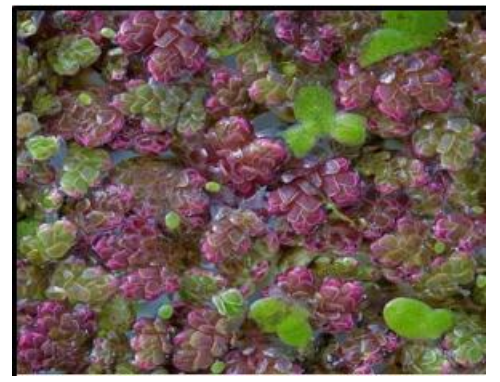
Figure 2: Azolla mexicana

Volume 14 Issue 2, February 2025 Fully Refereed | Open Access | Double Blind Peer Reviewed Journal www.ijsr.net