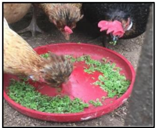
Figure 7: Azolla as Feed for Poultry

It was also found that broilers feed with Azolla resulted in growth and body weight values similar to those resulting from the use of maize-soya bean meal. Das et al., 1994 found that digested Azolla slurry remaining after biogas production was suitable as fish pond fertiliser.