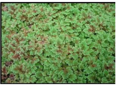
Figure 3: Azolla microphylla.