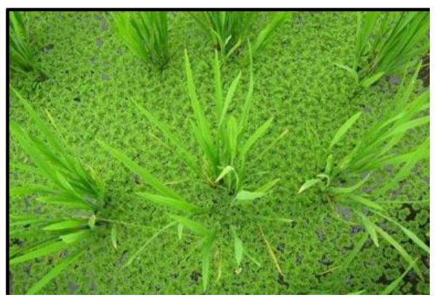
Figure 5: Azolla as biofertilizer in Cultivable Land

terrestrial animals, human food, medicine, water purifier, bio fertilizer, weeds and mosquitoes controlling agent, or removal of nitrogenous compounds from water. Azolla has been applied to the rich field as a classic fertiliser. It is a good source of protein and contains almost all essential amino acids and minerals. Various research has been done and is still ongoing to determine the capability of Azolla as a phytoremediation and to be used as a sustainable bioenergy source.