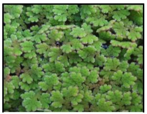
Figure 1: Azolla caroliniana

Azolla belongs to the Kingdom: Plantae, Division: Pteridophyta, Class: Pteridopsida, Order: Salviniales, Family: Azollaceae, Genus: Azolla. The genus Azolla consists of two subgenera and six living species. Subgenus Euazolla include four species: Azolla filiculoides, Azolla caroliniana, Azolla microphylla, Azolla mexicana. The Subgenus Rizosperma include two species: Azolla pinnata and Azolla nilotica