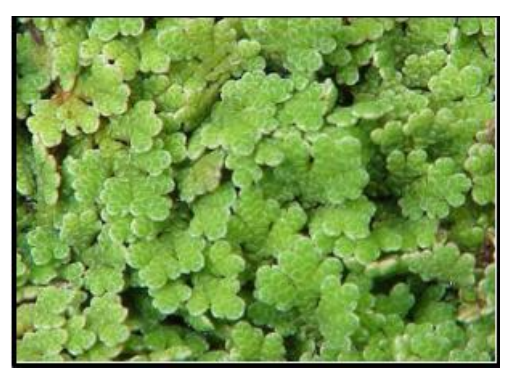
Figure 4: Azolla filiculoides

During the last few years, there have been extensive studies to evaluate the potential of Azolla to be applied as a green manure in rice fields, feed supplement for aquatic and