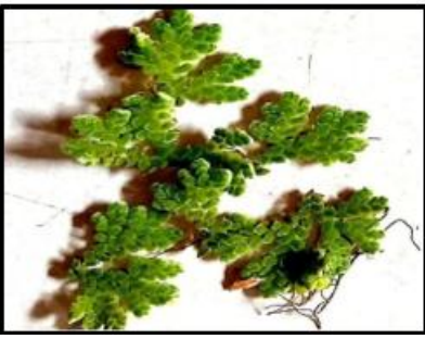
Figure 8: Azolla filiculoides

Azolla is also rich in proteins, essential amino acids, vitamins (vitamin A, vitamin B12, â Carotene), growth promoter mediators and minerals including calcium, phosphorous, magnesium, potassium, iron and copper. Among all the species, Azolla filiculoides is native to warm climates and tropical regions of the Americas as well as most of the old world, including both Asia and Australia .Azolla Filiculoides also grows in South America, western ,North America, Alaska, and Europe. Being a floating Aquatic fern, it can be found in usual stagnant waters, wetlands, and rice paddies in warm temperate and tropical regions, which is spread over lake surfaces to cover the water entirely. It takes only a few months to cover a lake.