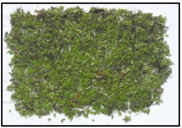
Figure 9: Shade Dried Azolla

samples were ground into a fine powder using a mixer grinder. The powdered samples were then stored in the air tight container and used for the analysis. The moisture content, ash content, protein, calcium, phosphorus, dietary fibre and total phenol were determined from the fern sample.