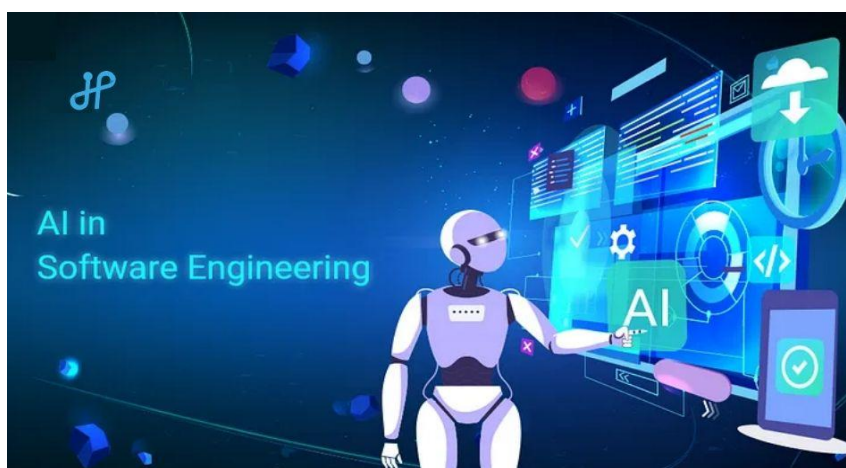
Figure 1: AI applications in software development

Non-developers can leverage AI to convert natural language inputs into functional code, democratizing software development. Platforms like Mendix and Bubble exemplify this trend.