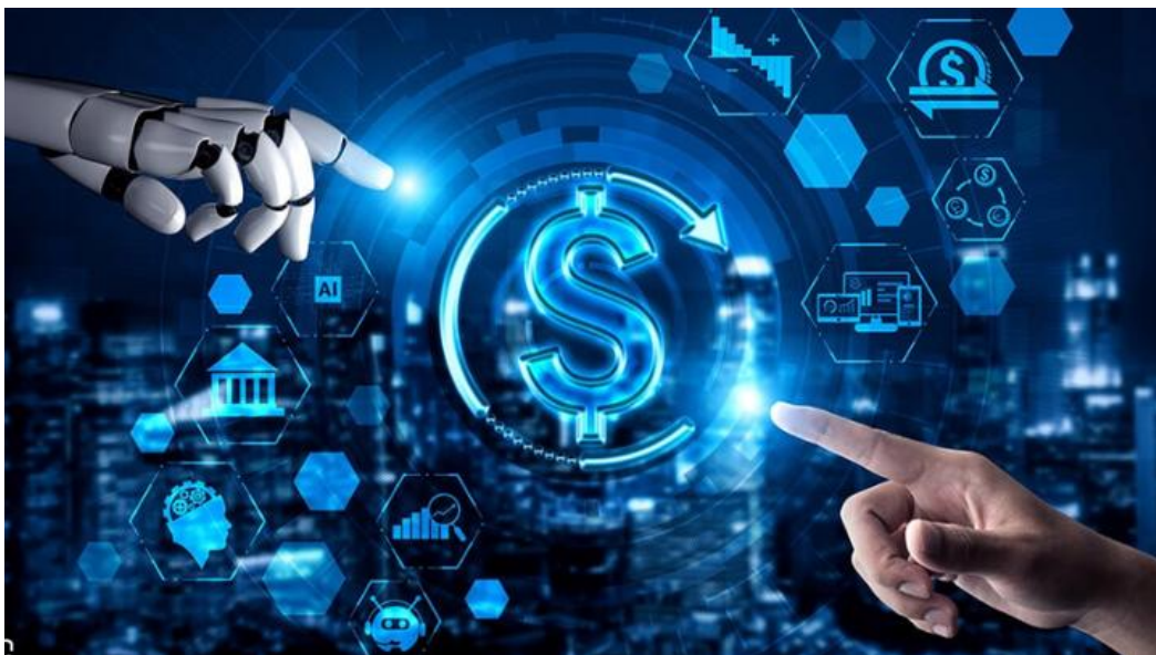
Figure 2: AI and its cost benefits