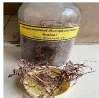
Figure 4: Brahmi

confidence, insights and memory review. The key compound asiaticoside demonstrates immunomodulatory effect by boosting the phagocytic index and increasing the total White Blood Cell (WBC) count. [5] - [6]