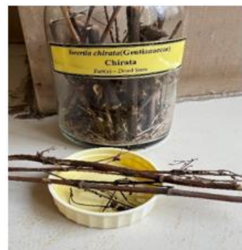
Figure 6: Chirata

It also known as Swertia chirayita , Chiretta, Anaryatikta, Bhunimba, Chiratikta, Kairata in Sanskrit. Dried plant of Swertia chirayita belonging to family Gentianaceae. It shows digestive, hepatic and bitter tonic properties. Chirata also have antidiabetic, anti - malaria, antipyretic as well as antitussive activities. The xanthones compounds found in Swertia chirata form an important group that exhibits anticancer property. [8]