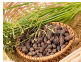
Figure 5: Nagarmotha

Nagarmotha also known as Cyperus rotundus . It consists of dried rhizomes of Cyperus rotundus from the Cyperaceae family. It exhibits a wide range of properties including analgesic, anti - allergic, anti - arthritic, anti - diarrheal, anti - emetic, anti - hypertensive, anti - malarial, anti - cancer, cardioprotective, neuroprotective and wound healing as well as the inhibition of brain Na + , K + ATPase activities. It is widely used as a raw material in the production of perfume and soap. [7]