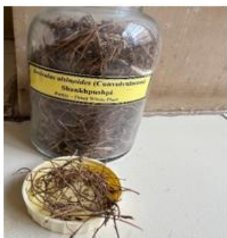
Figure 3: Shankpushpi

Shankpushpi also known as Convolvulus pluricaulis / Canscora decussata / Clitorea ternate . It consists of whole herb of Evolvulus alsinoides Linn. belonging to family Convolvulaceae. Shankpushpi is used for various medicinal properties like antioxidant, hypolipidemic, immunomodulatory, analgesic, antifungal, antibacterial, antidiabetic, antiulcer and cardiovascular activity. [4]