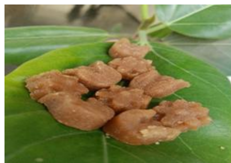
Figure 8: Prepared Herbal Candy