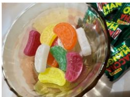
Figure 1: Sugar Candy

Common types of candies are, Hard candies (e.g., lollipops), Soft candies (e.g., toffees), Chewing gum, gummies & jellies.