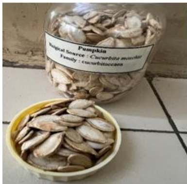
Figure 7: Pumpkin seeds

Pumpkin also known as Pepita . It is derived from seeds of Cucurbita moschata belonging to family Cucurbitaceae. It shows antidiabetic, anticancer activities, antioxidant, antimicrobial, anti - inflammatory, cholesterol - lowering, etc. [9]