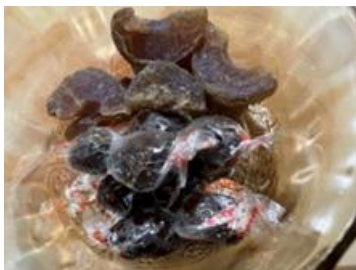
Figure 2: Herbal Candy

Rock candy also known as hard candies, is made from sugar. It is typically prepared by combining sugar and water. The crystallization process forms the basis of hard candy production. Hard candies differ from other types due to their minimal moisture content in the finished product. Candies are considered an instant source of energy due to their high calorie content. They are rich in flavor, easy to prepare and convenient to pack, transport and store.