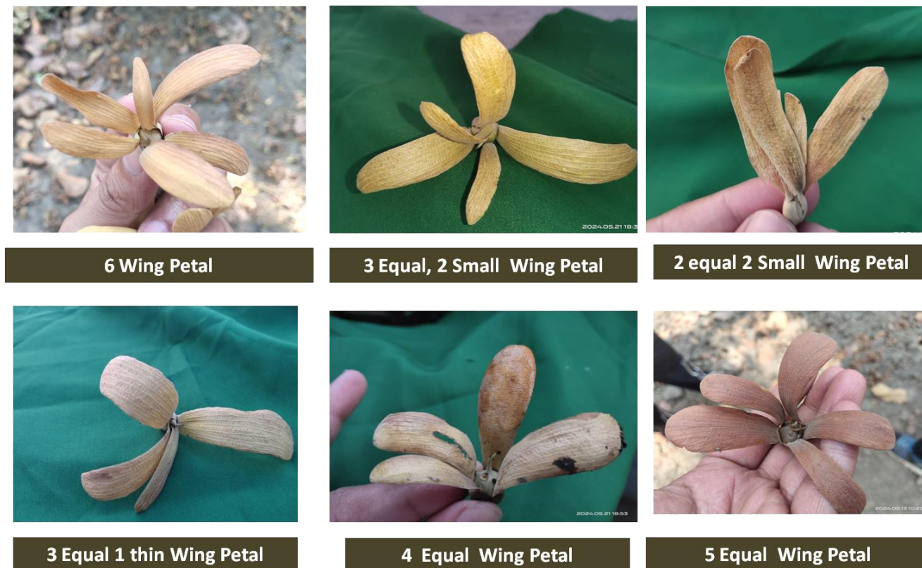
Figure 2: Observed Various wing petal of Sal ( Shorea robusta ) in Tarai East Forest Division, Haldwani