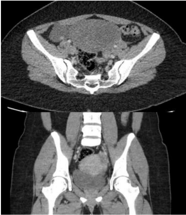
Figure 1: CT scan of this case showing around 12 - 14 cm size central pelvis mass arising from left side