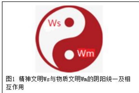
Figure 1: The unification and interaction of spiritual civilization and material civilization

of spiritual wealth, spiritual wealth is the root and trunk, and material wealth is the branch or leaf (Figure 1) [3].