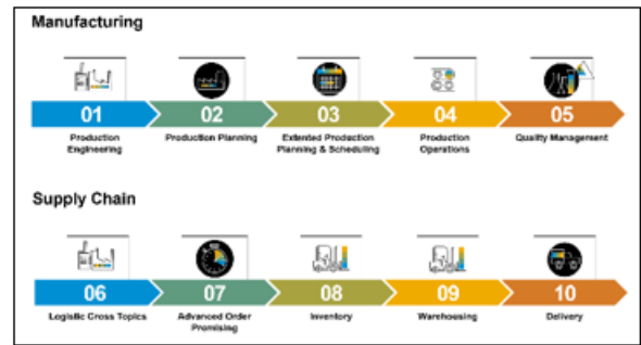
Figure 3: Supply chain flow in SAP S4 Hana Cloud

with your vision for the future in order to stay ahead of expectations and evolving market forces. From experience we know that these transformational journeys are already taking place.