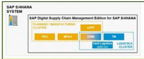
Figure 2: Supply Chain digital Transformation

bird's eye view as important events unfold. failures and uses real-time data to predict and prevent failures. Through advanced algorithm analysis, predictive maintenance solutions aim to lower operational costs and increase reliability. These solutions provide flexibility in maintenance planning. Preventive maintenance tasks should be reviewed to ensure their necessity when moving towards condition-based maintenance.