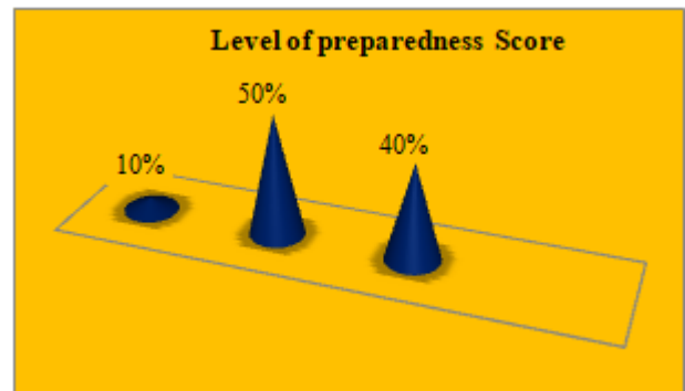
Figure 4.7: Column diagram showing percentage distribution of sample of preparedness score regarding menopausal transition.