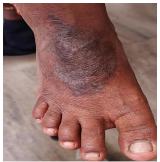
Figure 2: After treatment - 25/11/2024