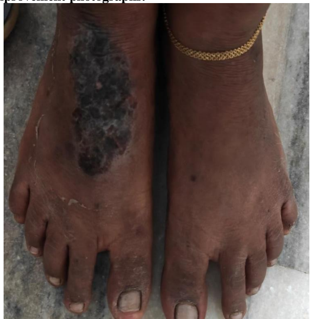
Figure 1: Before treatment - 29/7/2024