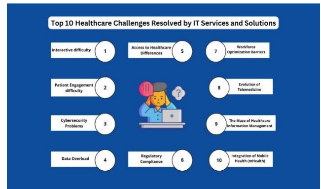
Figure 1: Healthcare challenges resolved by BTT

The most notable among the observable themes that recur in literature is that which pertains to how BTT plays a major role in increasing the productivity output of organizations. From such studies as done in various research studies, it could clearly be established that healthcare managers track workflow processes with resultant improvements as made by workflows. A perfect example will be argued on the role of a BTT system by the study that processing times make it possible for management to be able to point out concrete barriers which they feel must have resulted from the processing. This strategic means helps organizations efficiently distribute their limited resources and therefore enables process efficiency, resulting in quite some time being saved besides enhanced overall productivity.