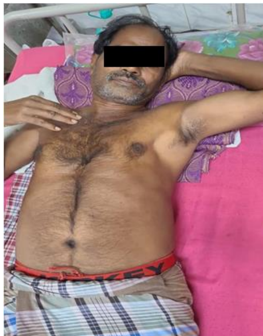
Figure 1: Showing left axillary swelling

Examination : single matted swelling of size 5*4*4cms, no skin changes, no dilated veins, smooth surface & with soft to firm in consistency noted with moderate mobility and non tender, no warmth. His vitals were within normal limits.