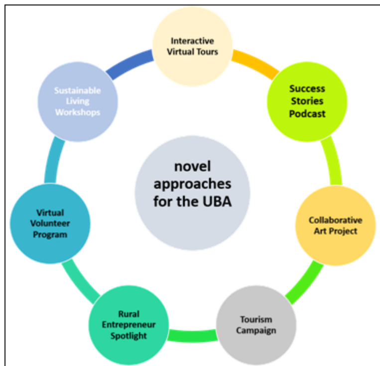
Figure 3: Novel Approaches for the UBA

rural India. Here are some innovative ideas that have been introduced to complement the existing initiatives: