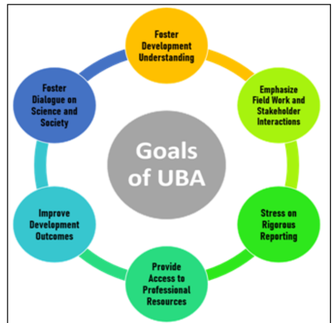
Figure 1: Goals of UBA

The primary objective of UBA is to bring about comprehensive development in rural areas by engaging higher educational institutions. The program encourages universities and colleges to adopt at least 5 villages and work closely with the local communities to identify and address their development needs