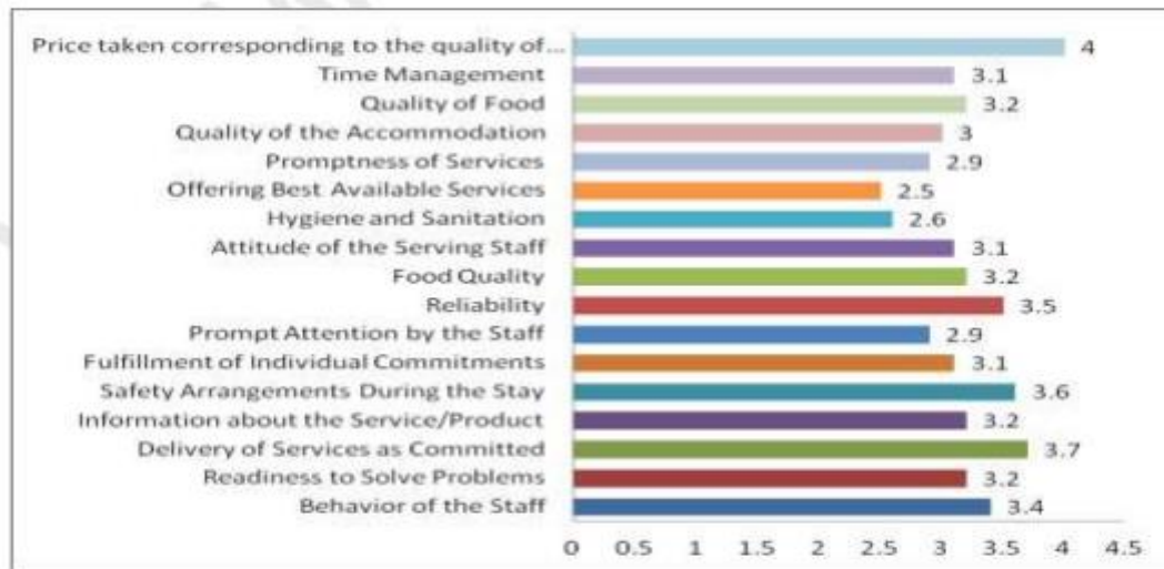
Figure 1.2 (b): Products and Services Offered at Hotels