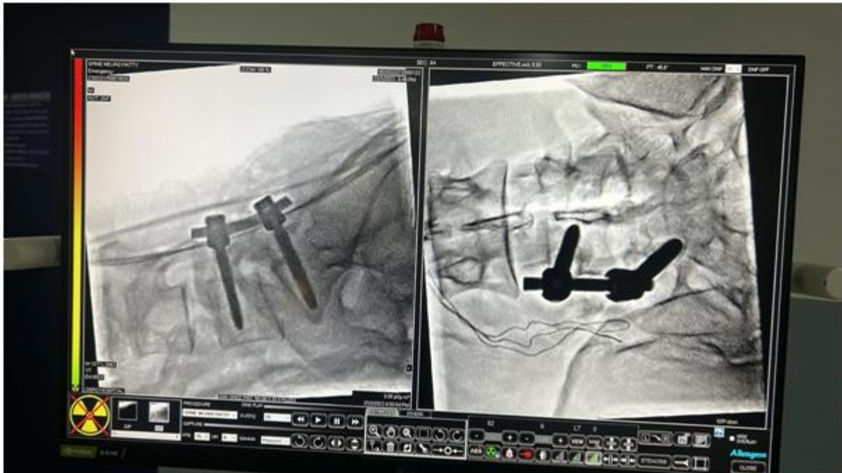
Case 3: Dilip Kumar 64 years male