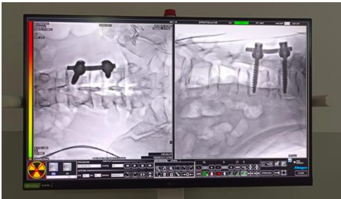
Case 4: Geeta devi