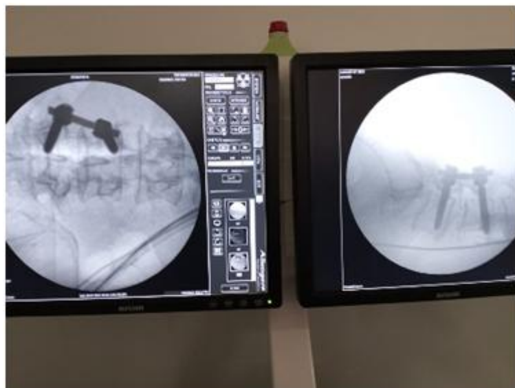
Case 2: Urmila devi