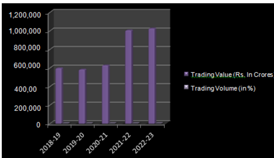
Chart 1: Internet Trading Value (Online Trading)

Thus from the above Chart, it is clear that year wise growth both in terms of Registered Users in Online Trading and increase in Trading Volume in Stock Market Indices.