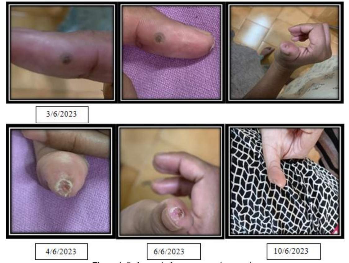
Figure 1: Before and after treatment photographs