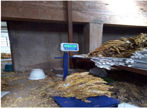
Plate 5: 300 kg digital weighing scale