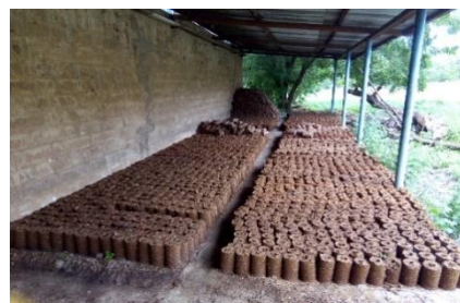
Plate 2: Sawdust briquettes