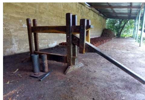
Plate 1: Low pressure briquetting machine

A low pressure or manually operated briquetting machine which was constructed by MHM Advent Company Limited was used in briquetting sawdust (Plate 4).