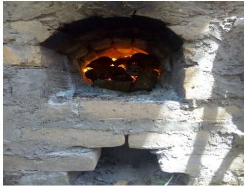
Plate 6: Burning of sawdust briquettes in a furnace