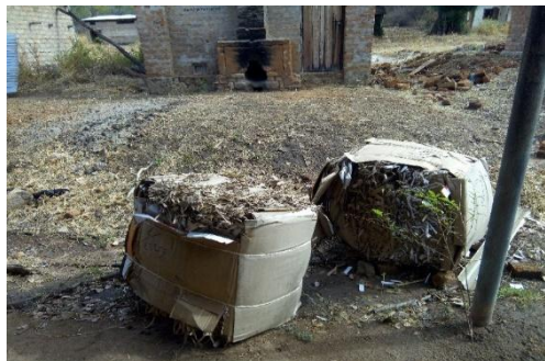
Plate 2: Waste paper as a binding materials