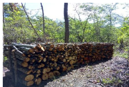
Plate 1: Firewood

Sawdust and firewood were used as source of energy for curing tobacco. Sawdust was collected from Tabora Saw mills which is located in Tabora town and was transported to trial site which is about 23.5 km from where they were collected. Firewood was collected from the natural forest which was about 2 km from the trial site (Plate 1).