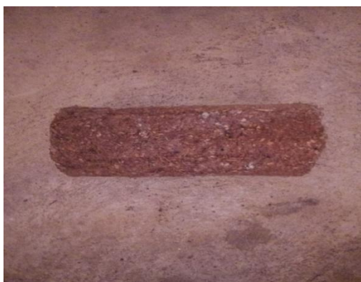
Plate 3: Longitudinal section of sawdust briquette