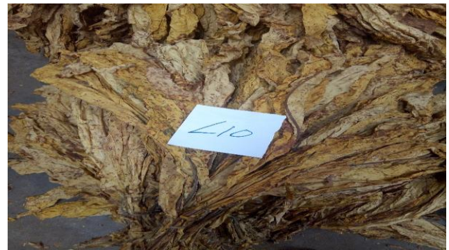
Plate 7: Top grade obtained after curing with sawdust briquettes

Since p value (0.091) is greater than the level of significance which was 0.05, hence there is no significant difference between the quality of tobacco cured by sawdust briquettes and that which was cured by firewood.