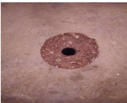
Plate 4: Cross-section of sawdust briquette