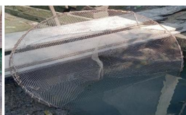
Fishing Trap (Chakni Jal).