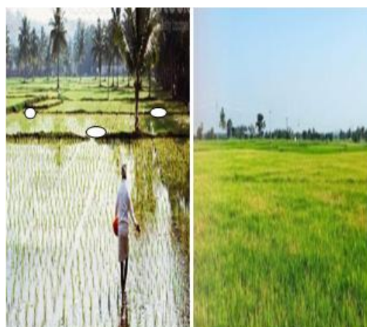
Figure 2: Aman Paddy Fields in Purba Medinipur District