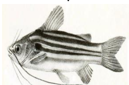
Mystus vittatus .