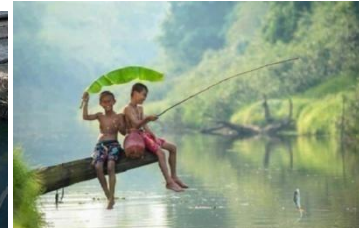
Fish angling (Bardhi)