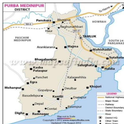
Figure 1: Purba Medinipur District Map

district is surrounded by its the Bay of Bengal in the East, Paschim Medinipur district in the West, Rupnarayan river and Howrah district in the North and in the South, there is Odisha state. The total area of this district is 4736 km 2 , total population is 51 lakh as per census 2011, total land under cultivation is about 430,140 ha and net cultivation area is 304,800 ha having 58% of total area of lands 1 .