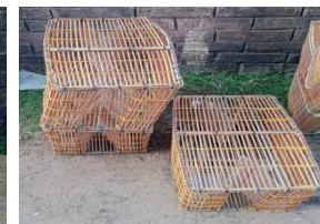
Fishing Trap (Charua).