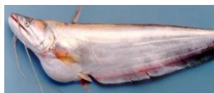
Wallago attu .