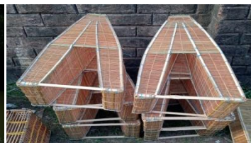
Fishing Trap (Mugri)