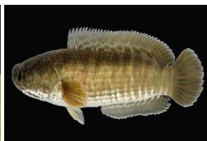
Channa striatus .