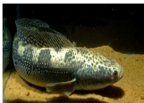
Channa marulius .