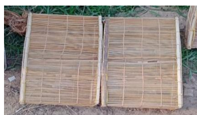
Fishing Trap (Ghuni).