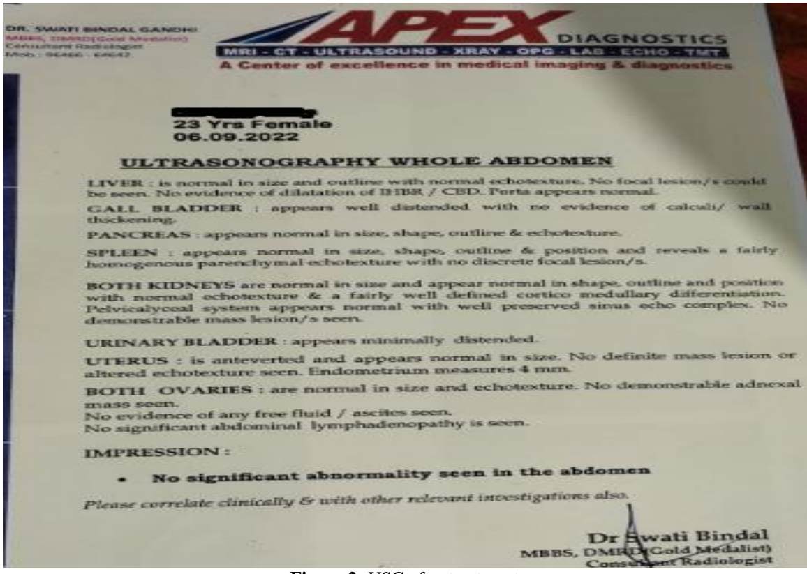
Figure 2: USG after treatment