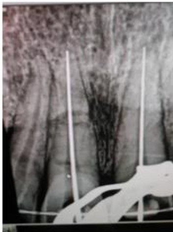
Figure 2: Working Length Determination

Endodontic treatment was planned for the patient. An informed consent was obtained from the patient after explaining the treatment procedure. Access cavity preparation was done followed by working length determination after local anesthesia under rubber dam fig.2. Instrumentation was performed using K- files(Mani, Japan). Along with instrumentation, irrigation was performed by 3%NaOCl (parcan, septodent healthcare PVT LTD., India) and 17% EDTA(Dent Wash, Prime Dental PVT LTD., India)alternatively separated by saline. An inter appointment calcium hydroxide dressing was given and patient recalled after 2 weeks.