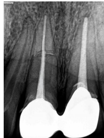
c) 1 year

In the second visit, teeth were asymptomatic and pain had subsided. Root canals were obturated with gutta-percha and biodentin sealer (Bio root RCS, Septodent). The access cavities were then restored with composite resin and finally restored with PFM crowns. Post operative follow up is done for one month, six months, one year, two years. Clinically the patient was asymptomatic and there is no mobility. Radiographically (fig.3) there is healing of the fractured line by the formation of the calcific tissue at peripheries of the fractured line and there is a decrease in radiolucency around the fracture fragments. At the end of two years lamina dura is intact and there is no periapical pathology on digital radiographs fig.3d. Cone Beam Computed Tomography (CBCT) was carried out to evaluate the healing fig.4.