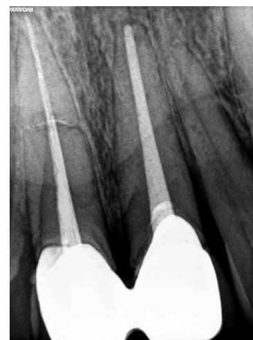
d) 2 years follow-ups