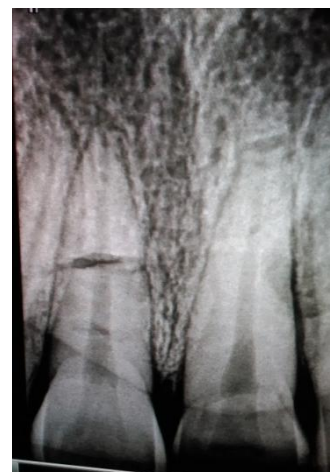
Figure 1: Preoperative radiograph

Radiographic examination revealed horizontal mid root fracture #11 while #21 had crown fracture fig.1. The immediate treatment consisted of semi-rigid splinting with orthodontic wire and photopolymerizable composite resin for 1 months.