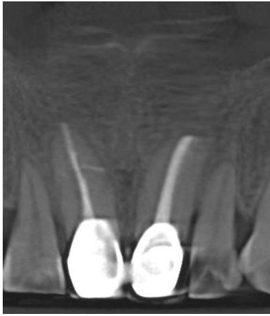
Figure 4: Cone beam computed tomography images showing the healing of fracture root; (a) sagittal view, (b) coronal view