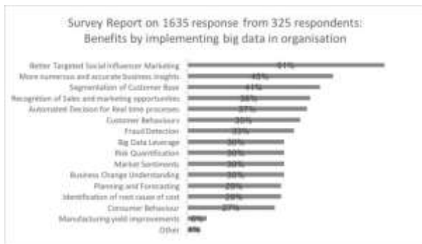
Figure 3 (Picture 4)

business change, planning, and forecasting. Big data analytics lead in a way to automate decisions in real-time business processes such as fraud detection, risk quantification. The other section in the figure depicts responses like loyalty, optimization, performance in the form of cost and quality.