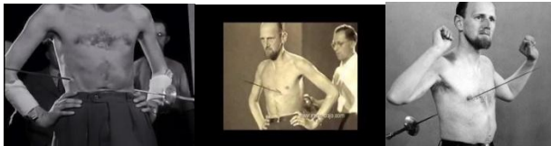
Figure: Amazing teachings by example