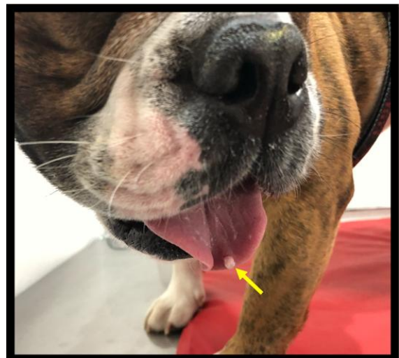
Figure 2: Lesion with a cauliflower - like appearance in the medial cranial portion of the tongue indicated by the yellow arrow

Case 2 – Female dog, English bulldog breed, 3 - years and 5 - months old, appetent, fed with natural food, weighing 15kg, and always treated by integrative medicine. The tutor noticed a whitish and rounded lesion in the left medial cranial region of the dog's tongue for approximately one week and took it to the veterinarian for evaluation. The tutor also commented that the patient had contact with dogs in the park one month before the veterinary appointment. The tutor noticed that two of the dogs had similar lesions two weeks after they last met. On physical examination, the patient had normal colored mucosa, TPC 2", active and alert behavior, cardiac and respiratory auscultation within the expected normal for age and species, hydration conditions within the expected normal range. Visual inspection of the oral cavity showed a single cauliflower - like growth/lesion in the medial portion of the left lower lip, which is characteristic of lesions caused by the papillomavirus (Figure 2). At this moment, the following homeopathic treatment protocol was instituted: three drops of T. occidentalis 6CH TID for 30 days combined with one ampoule of V. album D3 (Injectcenter®) given subcutaneously three times a week for 30 days. The clinical treatment was chosen as the only treatment.