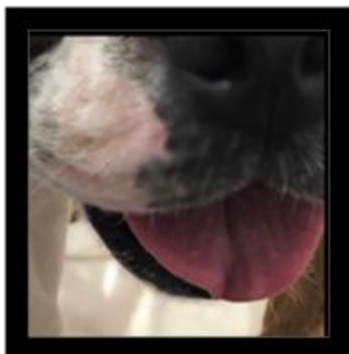
Figure 4: Aspect of the tongue after lesion resolution of the lesion diagnosed as papillomatosis.

Monteiro (2007) performed an in vivo experiment with 40 female dairy bovine, crossbred Dutch, in a semi - intensive regime, with different degrees of cutaneous papillomas. They were treated with T. occidentalis mother tincture and T.